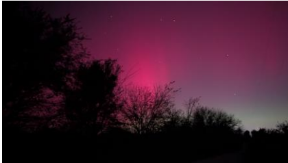
Max K0MDP captured this picture on 11112025.

That night (based on a Goes X-Ray Flux reading of X1.8, X1.2 and X5.1 which sent a solar storm that launched from region 4274) we knew we would see some aurora down to midlatitudes.