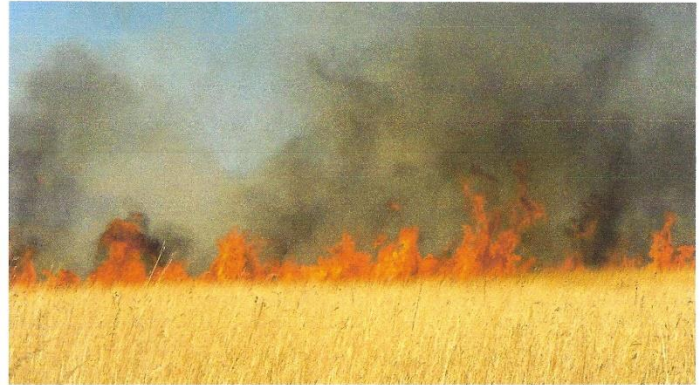
Operation: Smoky and the Land Lit