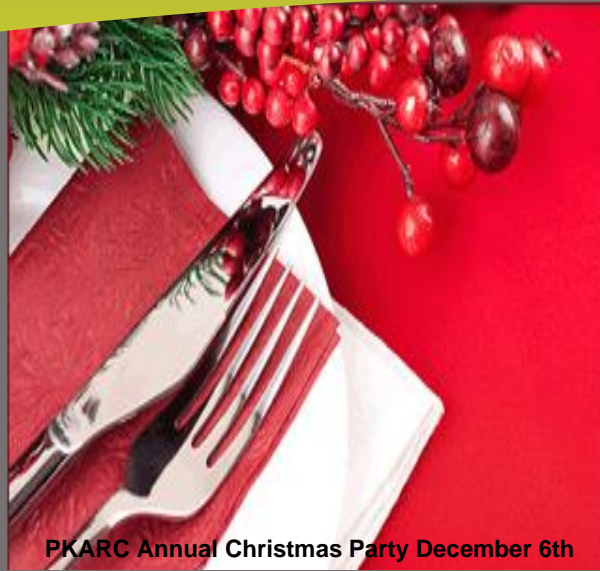
PKARC Annual Christmas Party December 6th